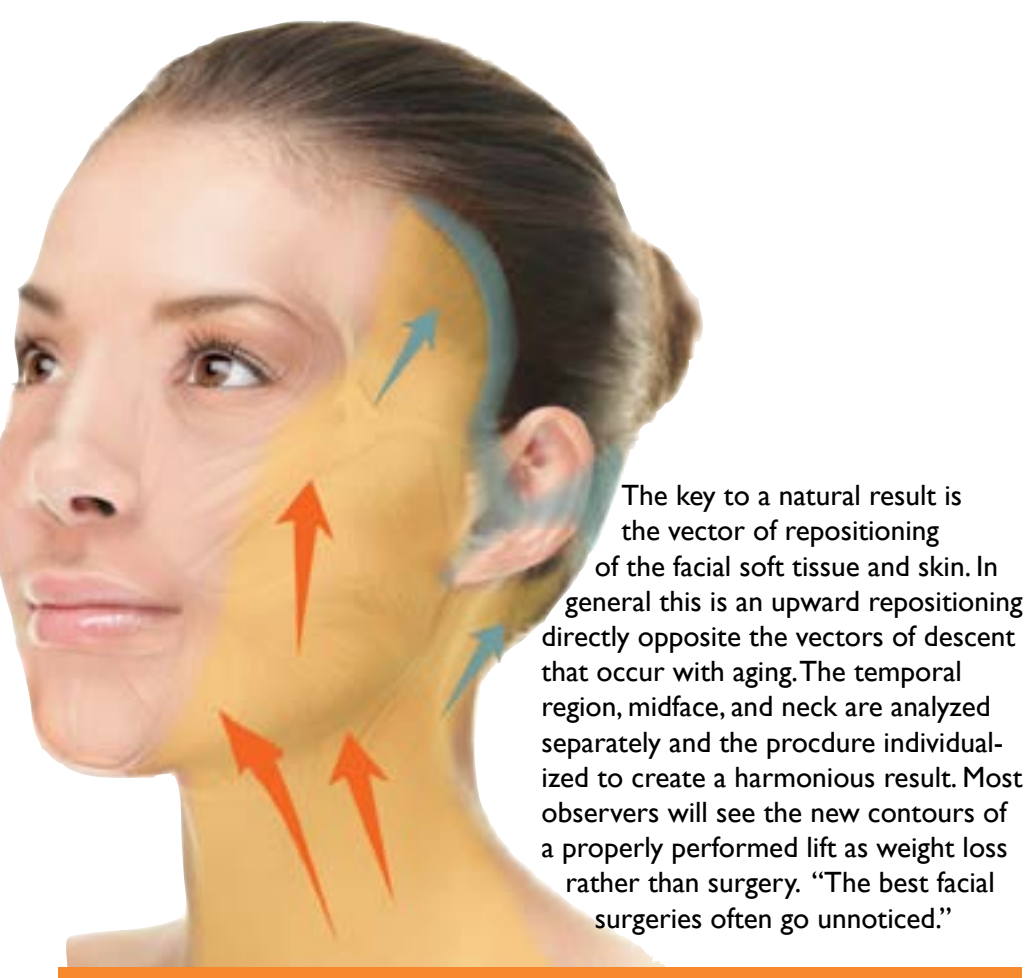
DIAGRAM OF FACELIFT: FASCIA AND SKIN ARE LIFTED & REPOSITIONED

An optimal aesthetic transformation will always involve elements of all 4 steps. Tightening the face and neck without improving complexion tone and texture, and investing in the skin care and lifestyle changes to maintain it, won't create a natural-looking, long-lasting change you desire.