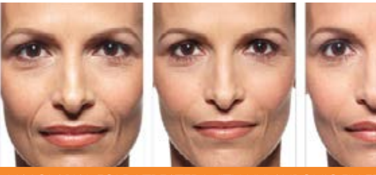
NASOLABIAL FOLDS TREATED WITH HYLAURONIC FILLER

Light-based devices such as lasers are designed to improve tone and texture. Laser rejuvenation can remove wrinkles, scars, enlarged pores, pigmentation, blood vessels and unwanted hair. Radiofrequency and/or magnetic devices such as Venus Legacy can retexturize and tighten skin with no down time. Pulsed magnet devices can also speed the natural healing process.