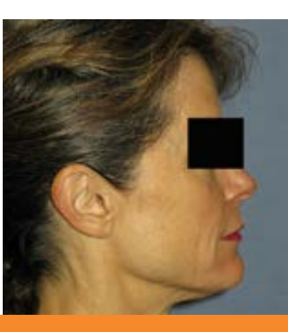
VENUS LEGACY 8 TREATMENTS

Light-based devices such as lasers are designed to improve tone and texture. Laser rejuvenation can remove wrinkles, scars, enlarged pores, pigmentation, blood vessels and unwanted hair. Radiofrequency and/or magnetic devices such as Venus Legacy can retexturize and tighten skin with no down time. Pulsed magnet devices can also speed the natural healing process.